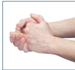
RUBS FOR 15-20 seconds